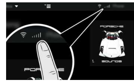
Fig. 11: Opening the Device Manager