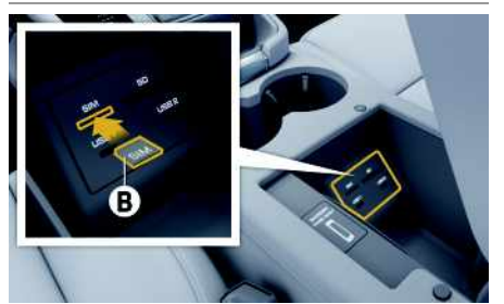
Fig. 1: Inserting and removing a SIM card