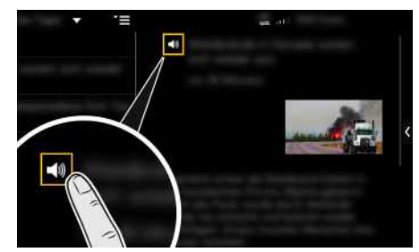
Fig. 9: Using voice function for news